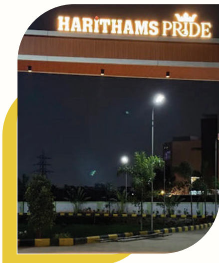
HARITHAMS SRT PRIDE Sri Sai Nagar, Ottiyambakkam