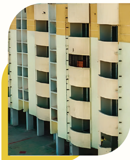
HARITHAMS APPURVA Kovur - Porur, Chennai