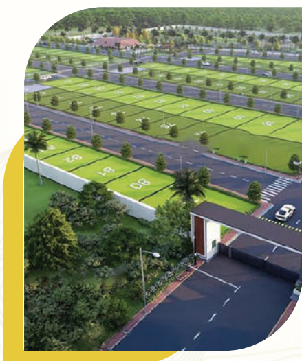
HARITHAMS ECR VILLA PLOTS Poonthandalam, ECR