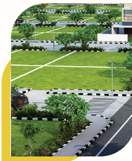
CMDA VILLA PLOTS Anakaputhur, Pammal