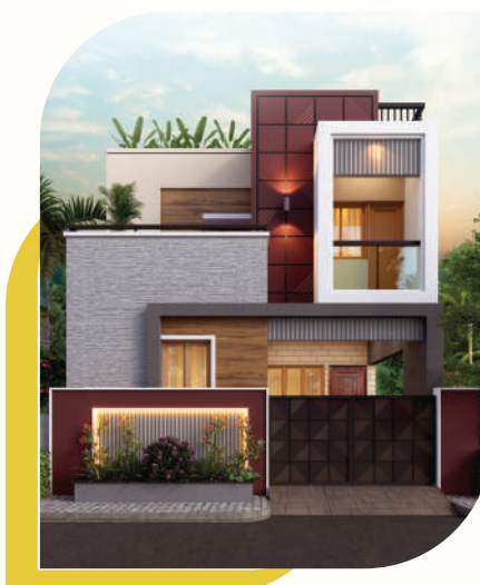
HARITHAMS PRIDE VILLAS Sri Sai Nagar, Ottiyambakkam