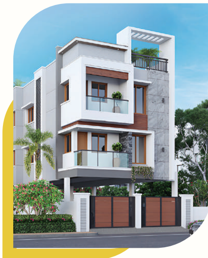
KANCHI AISHWARYAM Vegavathi Street, Kanchipuram